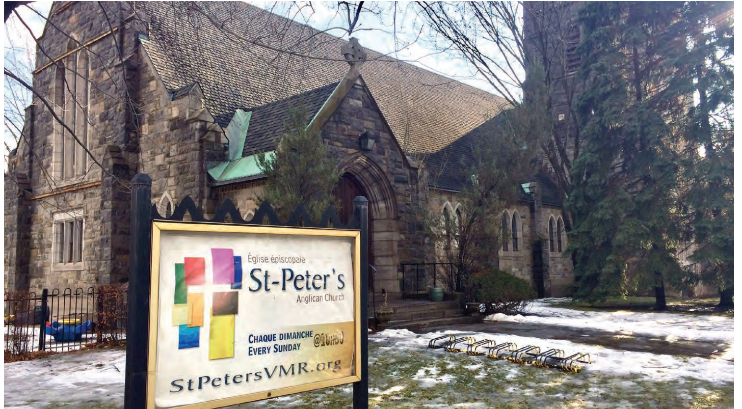
Saint Peter's Anglican Church at the corner of Laird and Churchill was sold by the Anglican Diocese of Montreal in 2019 to construction and property development company SAJO.