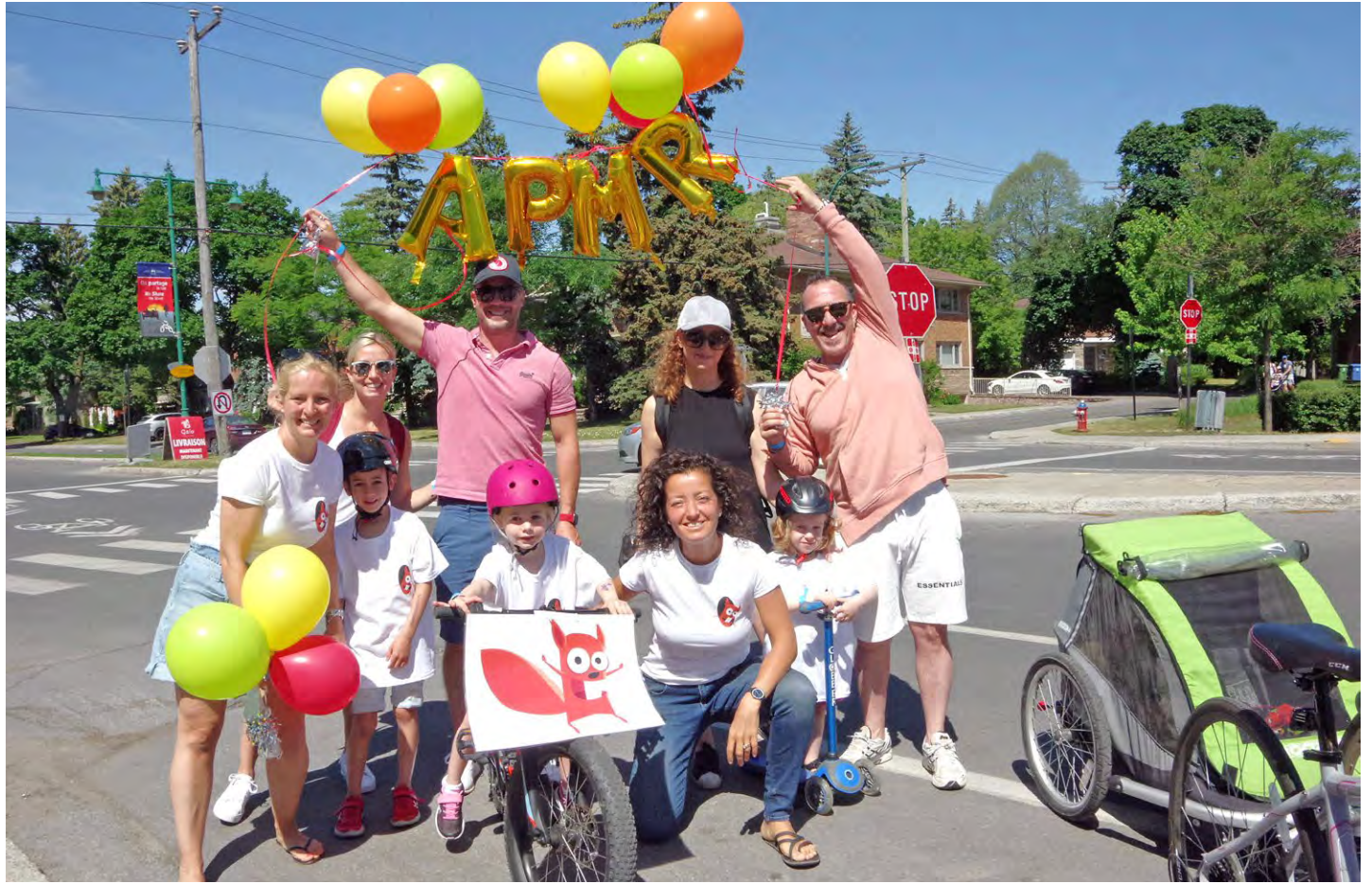
Sous un soleil brillant devant la bibliothèque municipale en juin l'an dernier, on peut voir des dirigeants et des membres de l'APMR au début de la toute première édition du Rallye 2021.

As she noted, the past few years have seen the number of young families with small