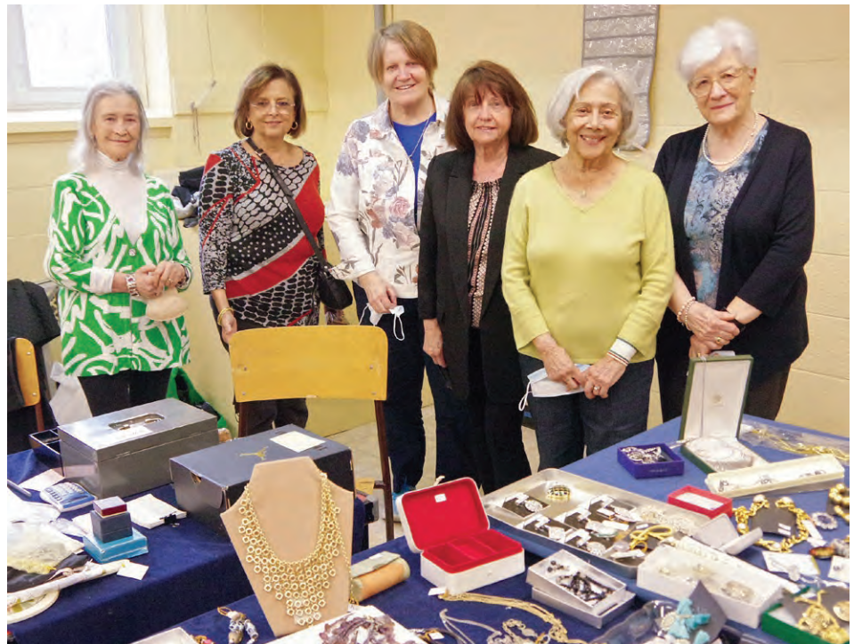
Volunteers in the jewellery department during the Spring Sale last Saturday at Mount Royal United Church.