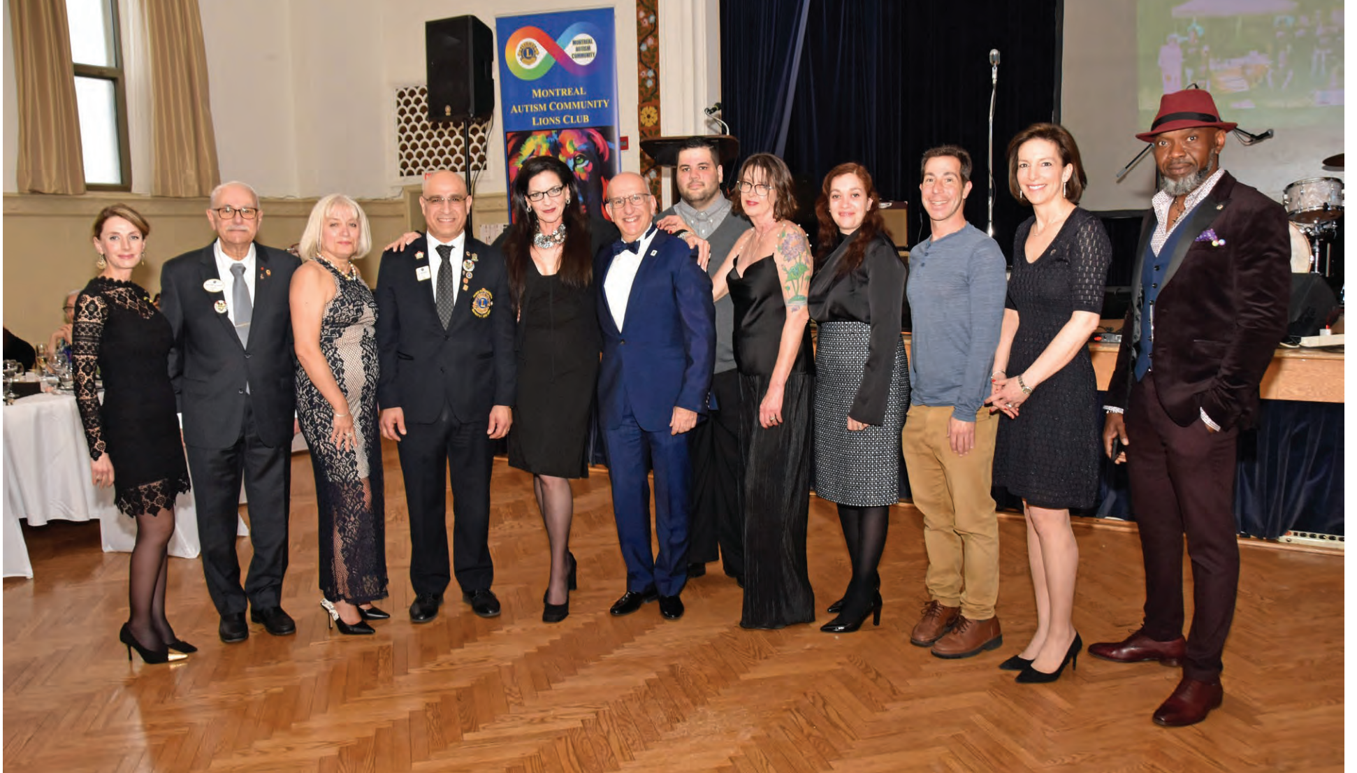
Seen here gathered in Schofield Hall last Saturday evening for the first anniversary of the Montreal Autism Community Lions Club are elected officials from the federal and provincial governments, and from TMR, along with Lions Club officials and supporters of the autism cause.