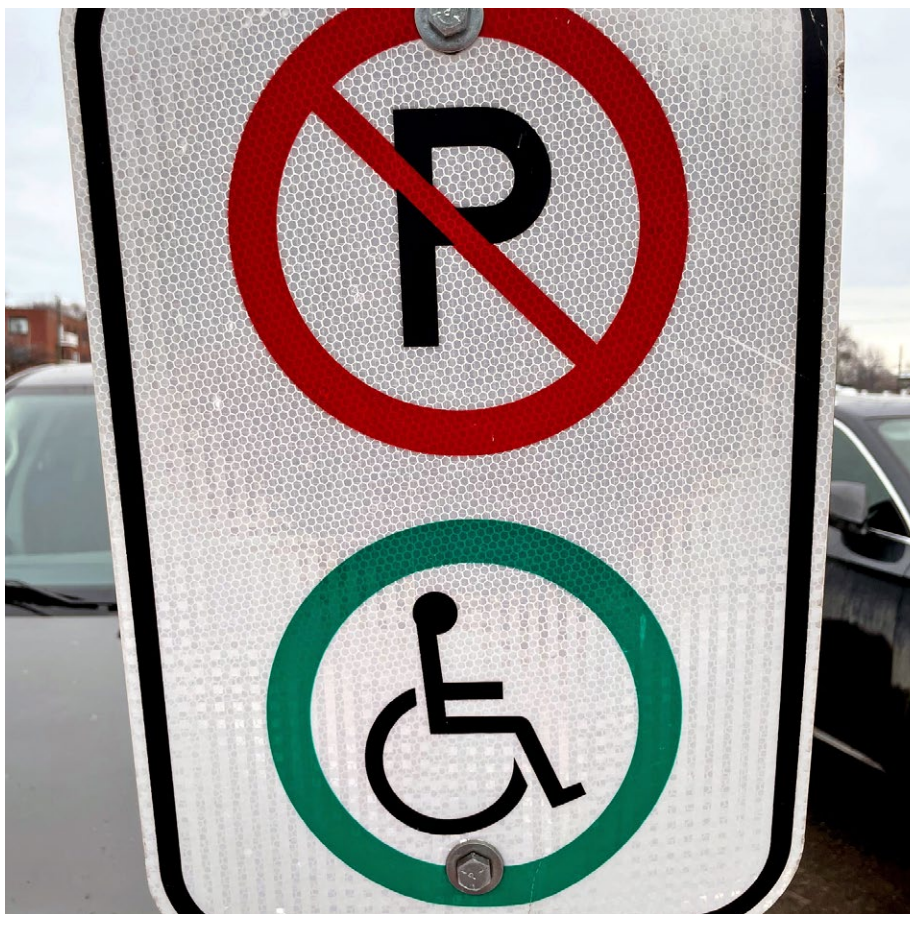
Un résident de VMR demande au maire Malouf d'augmenter les amendes imposées aux automobilistes qui stationnent sans permis dans des espaces réservés exclusivement aux handicapés.

Le maire lui répondait qu'il était complètement d'accord. « À vrai dire, on pourrait dire que je j'insiste beaucoup sur la sécurité du stationnement, disait le maire Malouf. Quand j'aperçois des gens qui stationnent des espaces