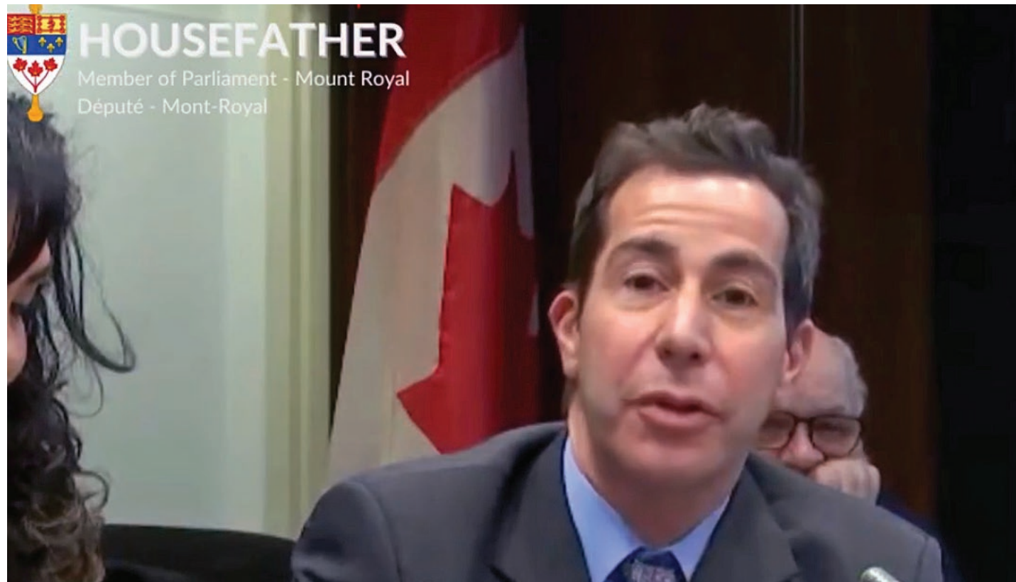
Mount Royal MP Anthony Housefather sits on the House of Commons' standing committee on information, privacy and ethics.

According to Housefather, the committee was recently studying the issue because of a